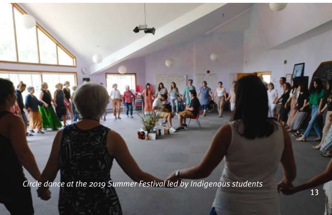
Circle dance at the 2019 Summer Festival led by Indigenous students