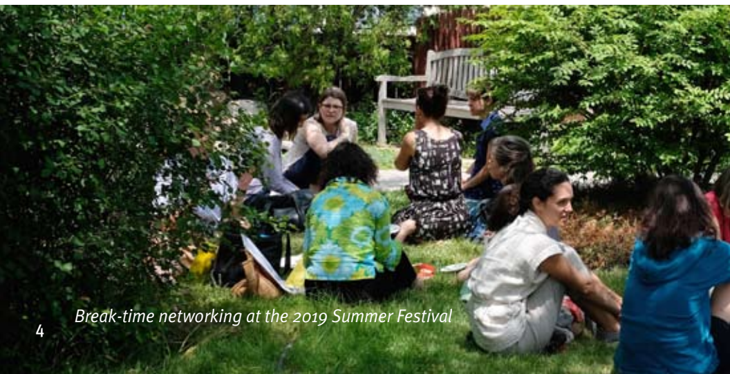
Break-time networking at the 2019 Summer Festival